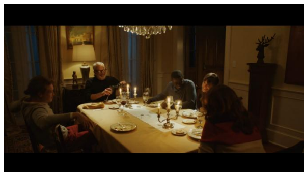
Figure 1. Dinner at the Armitage Family's House (0:21:54)