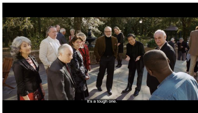
Figure 6. The Garden Party (0:54:42)

Furthermore, the use of verbal irony in this scene demonstrates how language can convey meaning indirectly, where the true intent is not explicitly stated but rather disguised as praise. As a result, the audience not only picks up on this discrepancy in meaning but also becomes aware of the hidden meaning behind the social interaction taking place. This underscores that verbal irony in this film is not merely a stylistic device but serves as a means to convey criticism of latent and covert racist practices.