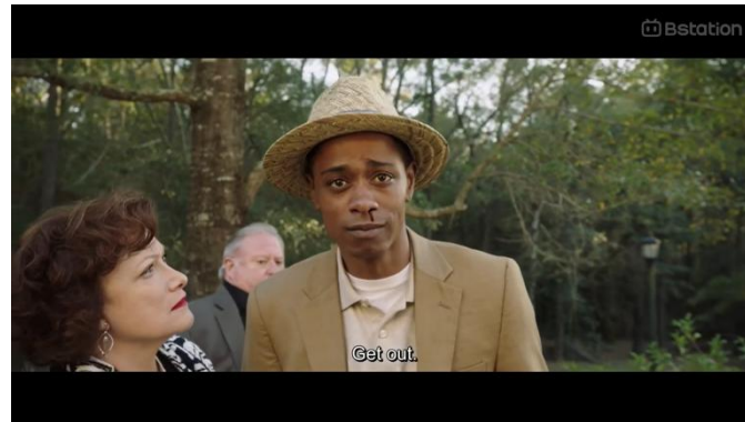
Figure 4. Logan's Sudden Outburst after the Camera Flash (0:55:49)

his body. According to Now You See It (2022), Interview with Jordan Peele, the Sunken Place is a metaphor for marginalization and the condition in which individuals lose their voice and control over themselves within an oppressive system. Thus, Chris's state not only demonstrates a physical loss of control but also represents a broader form of oppression. This visual representation reinforces the meaning of loss of control and alienation, while also highlighting how irony is constructed through the interplay of narrative and cinematic elements. Thus, this hypnosis scene not only displays dramatic irony but also reflects a social critique of unseen domination and control, where power operates subtly yet decisively.