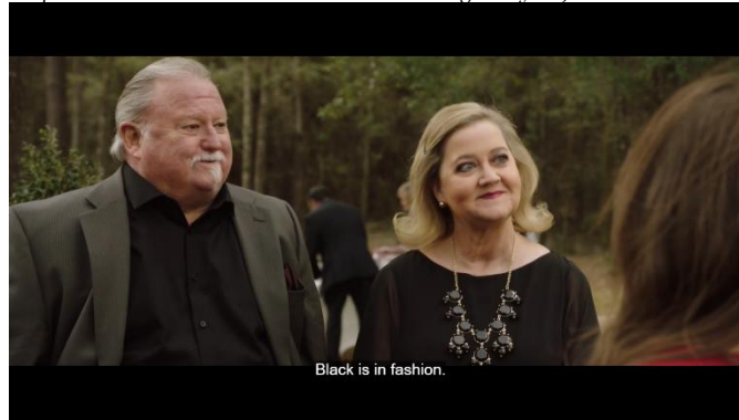
Figure 5. The Garden Party (0:43:48)

The garden party scene depicts social interactions that, on the surface, appear relaxed and full of appreciation for Chris. However, narratively, these interactions contain contradictions that generate verbal irony while simultaneously reinforcing situational irony. The white guests in this scene make various comments that appear positive, such as compliments on Chris's physical appearance and identity, but implicitly point toward a form of veiled objectification.