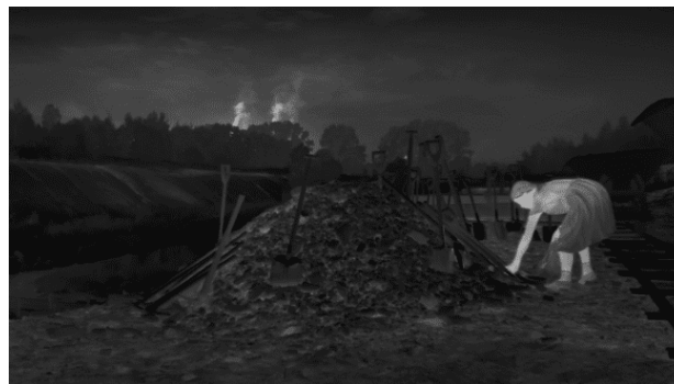
Figure 6. Polish girl smuggled fruit in workstation (01:05:50)

The scene where a young Polish girl secretly smuggles fruit, into a work area occupied by concentration camp prisoners. The act takes place at night or in low lighting, with shadows obscuring much of the setting and night vision filter. In the background, a train slowly passes on the tracks, its movement steady and indifferent, while faint smoke from the crematoria ascends, silhouetted against the dim sky.