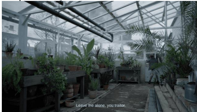
Figure 8. Höss's children playing around (01:23:29)

The placement of this moment in a park, a space often associated with peace and leisure, further contrasts with the soldier's physical suffering and psychological isolation. The benches, mostly empty, visually reinforce his abandonment. The scene thus serves as a powerful commentary on the dissonance between ideological spectacle and lived reality, making it a poignant example of irony of character.