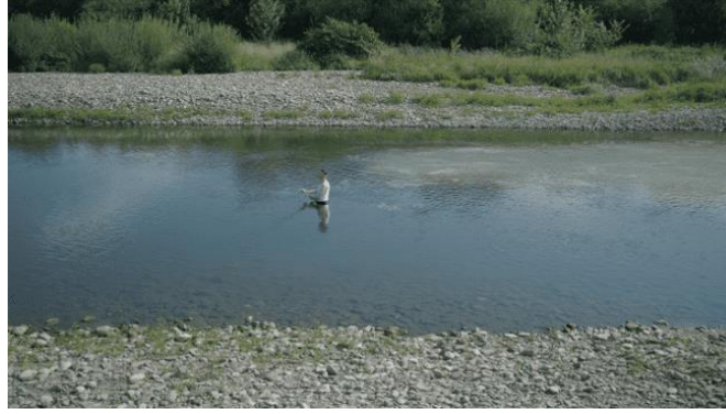
Figure 10. Rudolf Höss fishing in the river (00:32:57)

Another example of irony of setting appears in the scene where Rudolf Höss and his children play and enjoys leisure time in a river. The wide long shot emphasizes the idyllic beauty of nature, a space that traditionally symbolizes purity, life, and innocence. Nonetheless, this image is tainted by a horrifying undercurrent, the river itself has been contaminated by the human remains from the crematoria of Auschwitz, where countless human lives are systematically extinguished.