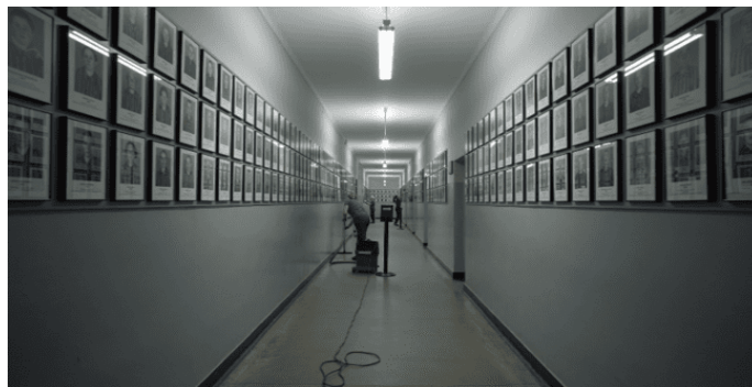
Figure 15. Future Holocaust museum hall (01:37:11)

This scene depicts Rudolf Höss in a liminal space, a sterile, geometrically strict staircase and hallway, representing the inner psychological torment he experiences as the architect of mass murder. Höss pauses mid-step, bent over in discomfort, suggesting physical sickness. This moment of physical vulnerability subtly reveals the rupture between his conscience and the systemic violence he upholds. Although Höss serves with unwavering loyalty to the Nazi regime, this gesture suggests his body briefly betrays him. His psychological repression briefly breaks through, signaling a metaphysical conflict between duty and morality. This dissonance is central to cosmic irony, where fate or the universe seems cruelly to manipulate events contrary to human expectations or desires (Petrie & Boggs, 2008).