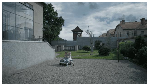
Figure 1. Höss's children playing in the yard (00:39:44)

The data in this section is in minute 00:39:44, In the scene, dramatic irony appears in a long shot where children play joyfully in the yard, riding toy cars, while their mother watches from behind the glass wall of the house. In the background, the entrance gate and guard tower of Auschwitz are clearly visible. The innocence and happiness of the children take place just a few meters from the site of the mass murders.