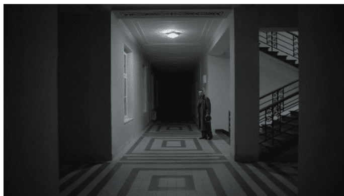
Figure 16. Rudolf Höss gazed at empty space (01:37:20)

The use of the long shot and deep focus highlights Höss's solitude within vast, symmetrical architectural spaces. The subsequent scene abruptly transitions into a contemporary museum corridor in current-day Auschwitz, where cleaning staff tidy up beneath rows of portraits of former victims. This temporal break implies an ironic judgment by history. Höss, frozen in his time, is confronted by a future that memorializes what he tried to erase. The continuity between the cold symmetry of his present and the modern institutional space of remembrance offers a visual bridge between guilt and historical reckoning.