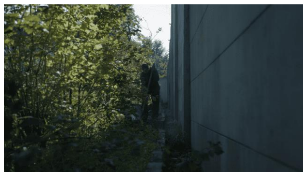
Figure 4. Höss's gardener is fertilising the plants (01:17:18)

According to Petrie and Boggs (2008), situational irony arises when the true outcome of events starkly contrasts with the anticipated result, frequently emphasizing the emotional or moral discord within the storyline. Here, the mother's quiet exit during the night juxtaposed with her cheerful greeting and the early atmosphere of familial love forms a touching situational irony. Instead of accepting the comfort and luxury of her daughter's home, she pulls away from it, understanding that it is rooted in widespread suffering and tragedy.