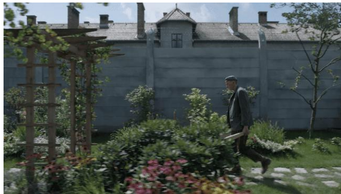
Figure 9. Höss's gardener walking along the garden (00:11:13)

This scene exemplifies irony of setting as defined by Petrie and Boggs (2008), where in the physical environment contradicts the emotional or moral reality of the narrative. In The Zone of Interest , the visual field is dominated by the beautifully arranged and thriving garden of the Höss household. Colorful flowers, symmetrical paths, and lush greenery convey a sense of domestic peace and cultivated beauty. Within this composition, the gardener is seen tending to the plants, but in the background, unmistakably visible through the long shot composition, stands the grey concrete wall of Auschwitz concentration camp, crowned with barbed wire. The spatial alignment in the frame vibrant life in the foreground, a system of mechanized death in the background is not coincidental. The shouting, the gunshot, and the screaming of the victims suddenly appear clearly in the background. The garden, a traditional symbol of growth and innocence, is here repurposed to mask or coexist with genocide, revealing the chilling coexistence of aesthetic beauty and ethical horror.