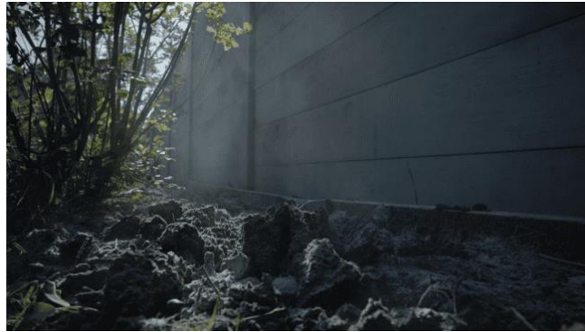
Figure 5. Human remains as fertilizer (01:17:11)

A scene in which a gardener spreads ash into the soil to fertilise the plants in the Höss family garden. A long shot shows the gardener as a small and insignificant figure in the midst of a lush landscape, performing his task with mechanical precision, without emotional expression or narrative emphasis. On the surface, the audience sees routine gardening activities, nurturing life, cultivating beauty, and fostering growth.