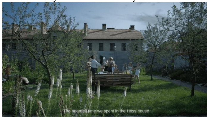
Figure 11. Höss's families gathering in the yard (00:45:26)

In this scene, nature becomes complicit not through intention, but through the contamination imposed upon it illustrating how evil seeps into even the most innocent corners of existence. The irony of this setting forces the viewer to reflect on how genocidal violence distorts not only human morality but also the sanctity of the nature.