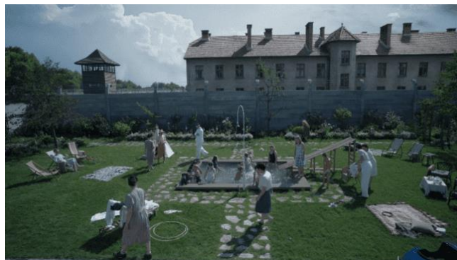
Figure 13. Höss's families gathering in the yard (00:46:58)

This moment powerfully illustrates what Boggs and Petrie define as irony of tone, where "the filmmaker creates a tone that seems inappropriate to the subject matter, thereby forcing us to consider the moral implications of what is shown". The elegance of Höss's white attire traditionally connotes purity and virtue, yet it is disturbingly misaligned with the atrocities surrounding him. The dissonance between visual tranquility and moral outrage forces the viewer into a state of moral and ethical discomfort.