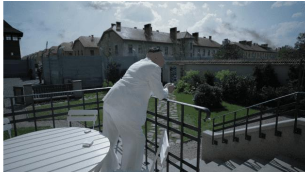
Figure 12. Rudolf Höss leaning in the terrace (00:45:55)

In this scene (minute 00:45:55), Rudolf Höss is shown dressed in an immaculate white suit, leaning casually on a balcony railing, preparing to join his family and guests for what appears to be a pleasant afternoon gathering. The entire mise-en-scène is composed with bright lighting, soft shadows, and a clean color scheme, contributing to a visual tone of serenity, civility, and composure. However, just beyond the garden's edge, in sharp contrast to the tranquil domesticity, smoke rises from the crematoria of Auschwitz the site of mass extermination being carried out under Höss's direct supervision.