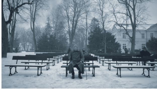
Figure 7. Wounded soldier sitting in public bench (01:17:51)

harsh sterility of the camp makes her action not only compassionate but also a courageous act of subtle resistance