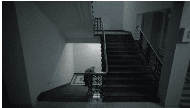
Figure 14. Rudolf Höss descending the stairs (01:33:06)

This scene depicts Rudolf Höss in a liminal space, a sterile, geometrically strict staircase and hallway, representing the inner psychological torment he experiences as the architect of mass murder. Höss pauses mid-step, bent over in discomfort, suggesting physical sickness. This moment of physical vulnerability subtly reveals the rupture between his conscience and the systemic violence he upholds. Although Höss serves with unwavering loyalty to the Nazi regime, this gesture suggests his body briefly betrays him. His psychological repression briefly breaks through, signaling a metaphysical conflict between duty and morality. This dissonance is central to cosmic irony, where fate or the universe seems cruelly to manipulate events contrary to human expectations or desires (Petrie & Boggs, 2008).